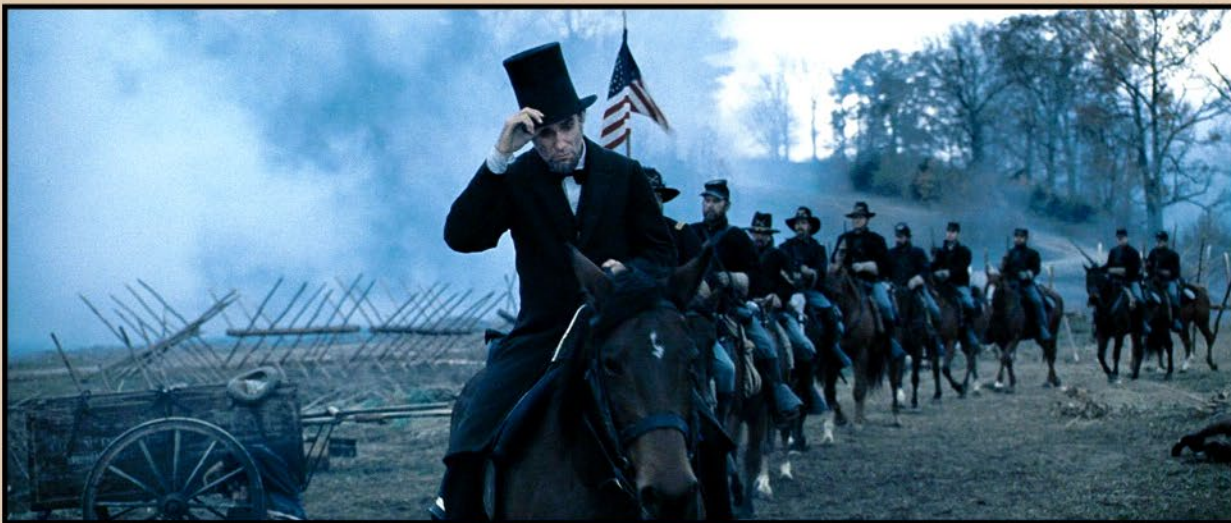
Lincoln (2012, d. Steven Spielberg)