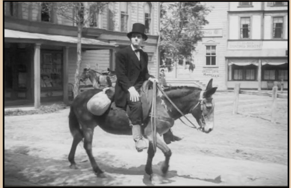
Young Mr. Lincoln (1939, d. John Ford)